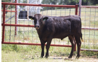
TBR Michitani 8121L